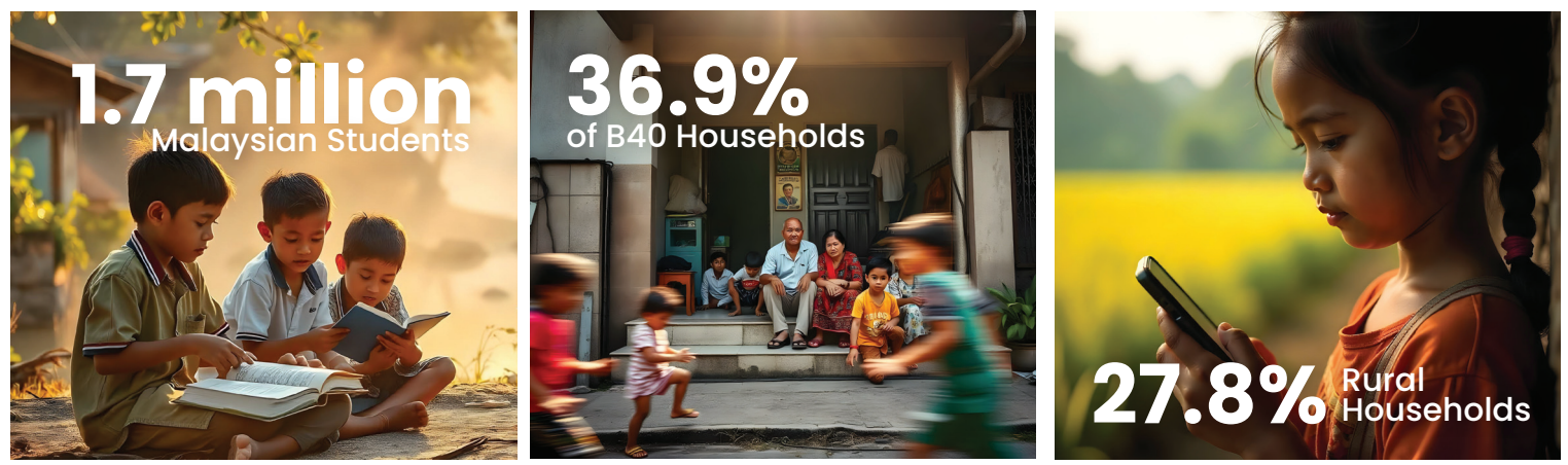
1.7 million Malaysian students lack access to electronic devices essential for e-learning.